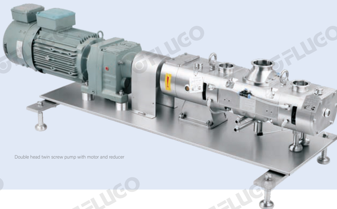
Double head twin screw pump with motor and reducer